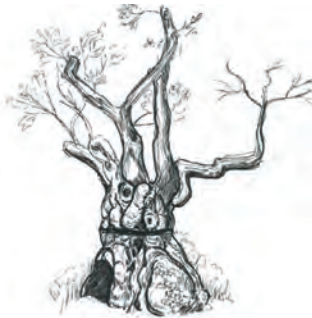
Big Belly Oak

Return to the main path and continue for half a mile. Turn right when you reach GRAND AVENUE. At 3.9 miles, the beech-lined avenue is the longest in Britain, stretching from the outskirts of Marlborough to almost the front door of Tottenham House.