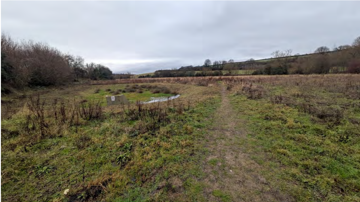
Photo taken in January 2026 and AI image of how it could look in summer.