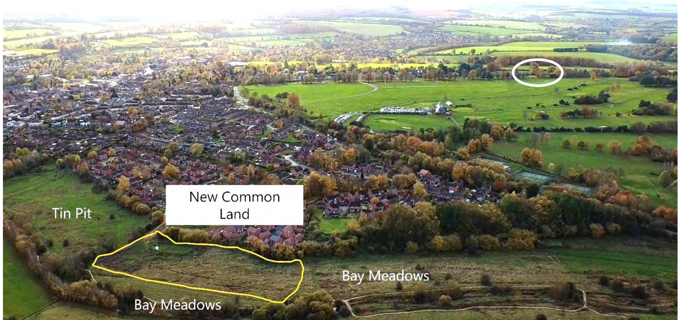
Photo: outlined top right is the location of the Cemetery

The proposed new common land is near Hawthorn Meadow, between the open space known as 'Tin Pit' and the Bay Meadows Nature Reserve. Pedestrian access is via Portfields Road. It is approximately 4 times larger than the area at Marlborough Common.